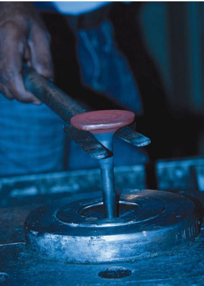
In the initial forging process, the glowing valve is being pressed.

Valve brands that are manufactured at this facility include the flagship AE® brand, Sealed Power®, Speed-Pro®, FM Range and FP Diesel®, while bearings include copper and lead-free Glyco®, AE®, FM Range, and FP Diesel bearings.